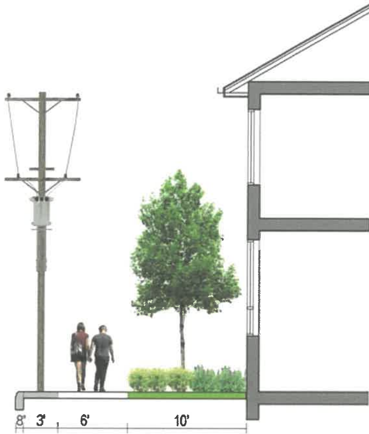
Figure 1. Cross section of 20-foot commercial setback